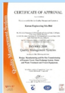
QMS ISO 9001:2015