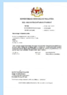
MOF - Registered