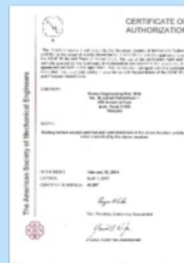
ASME Heating Boiler H - Designator