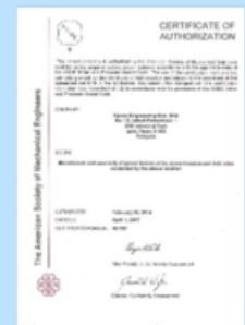
ASME Steam Boiler S - Designator