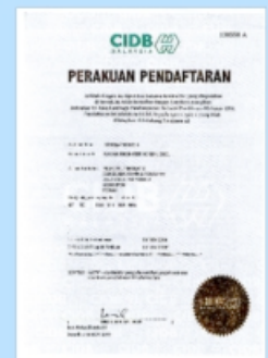
- CIDB - - G7 Contractor