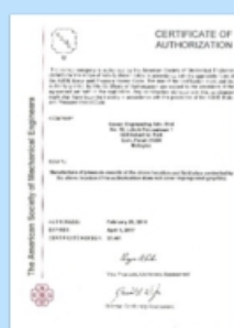
ASME Pressure Vessels U - Designator